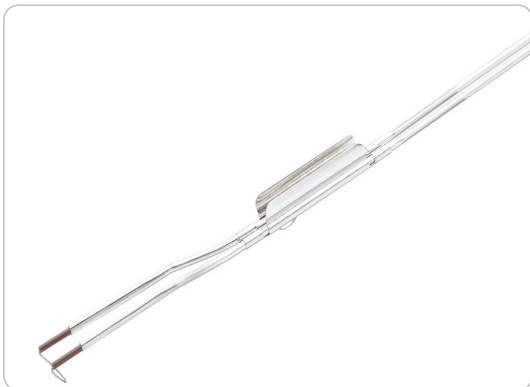
Figure 2. Wire Loop

An advantage of this technique is that it can be performed at any time of the month, without specific preparation, since the lining layer is removed and the underlying muscle layer is easily identified. A disadvantage is that it requires the tissue to be cut, which may cause bleeding from the blood vessels in the muscle layer.