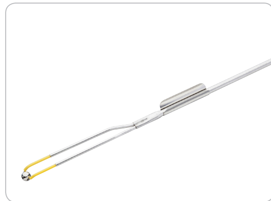
Figure 3. Roller Ball

An advantage of this technique is that it does not require any cutting at all and therefore women who have conditions that affect their blood or are on blood thinning medication may benefit. It may be necessary to time the procedure to just after a menstrual cycle or have medication that will keep the endometrium thin if this is the procedure chosen.