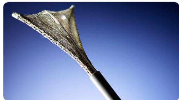
Figure 4. Electrosurgical resection endometrial ablation

Electrosurgical resection endometrial ablation: during this endometrial ablation a single-use sterile device is placed into the uterine cavity in a closed position and then opened out, a bit like a small and flattened umbrella (Figure 4). The surface of the device is wire mesh and this is attached to a generator that has a suction device in it. The lining of the uterus is sucked onto the wire mesh and an electric current is passed through the mesh. This destroys the entire endometrium.